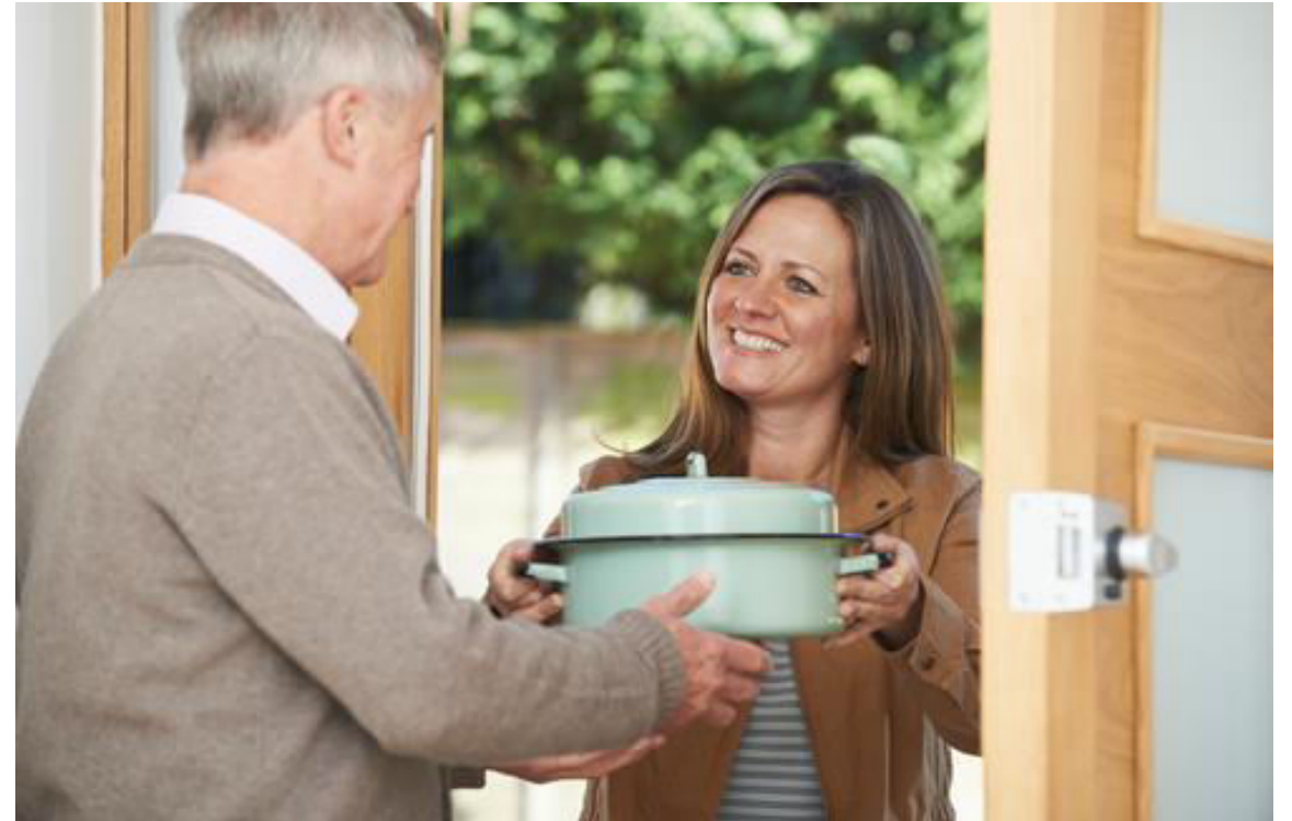
Strengthening of ties with family, friends, neighbours