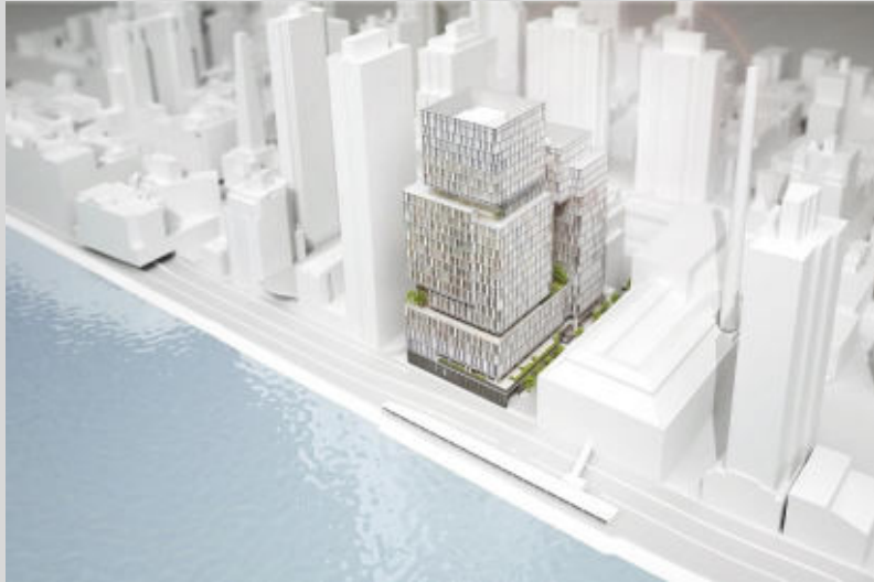
Memorial Sloan-Kettering Cancer Center, NY: 760,000 GSF, $1,5 billion