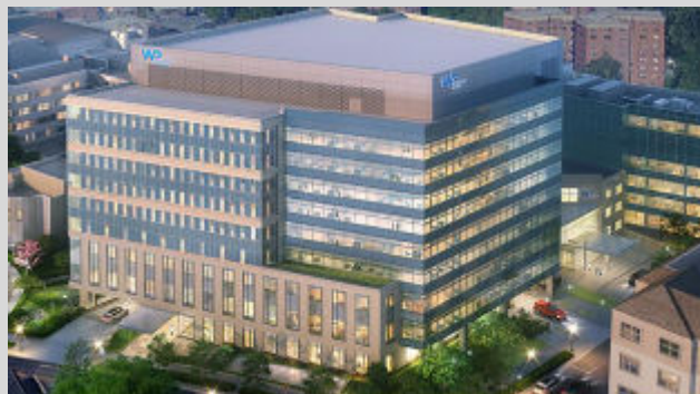
White Plains Hospital, NY: 250,000 GSF, $272 million