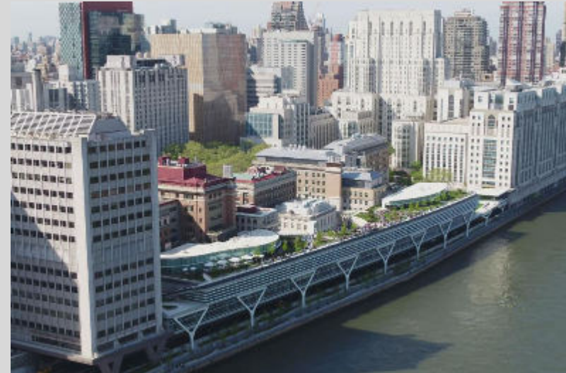
Rockefeller University Campus Expansion, NY: 300,000 GSF, $500 million